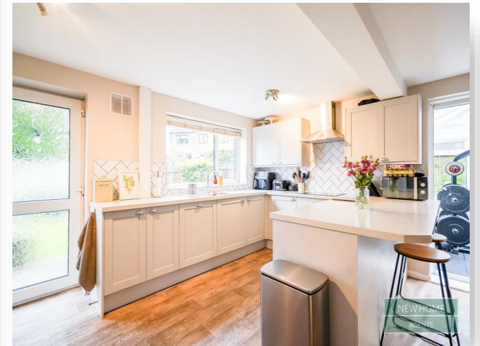
Ash Hill Drive, Leeds LS17 8JR