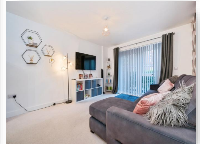
Arcadia, John Thornycroft Road, Southampton SO19 9XF