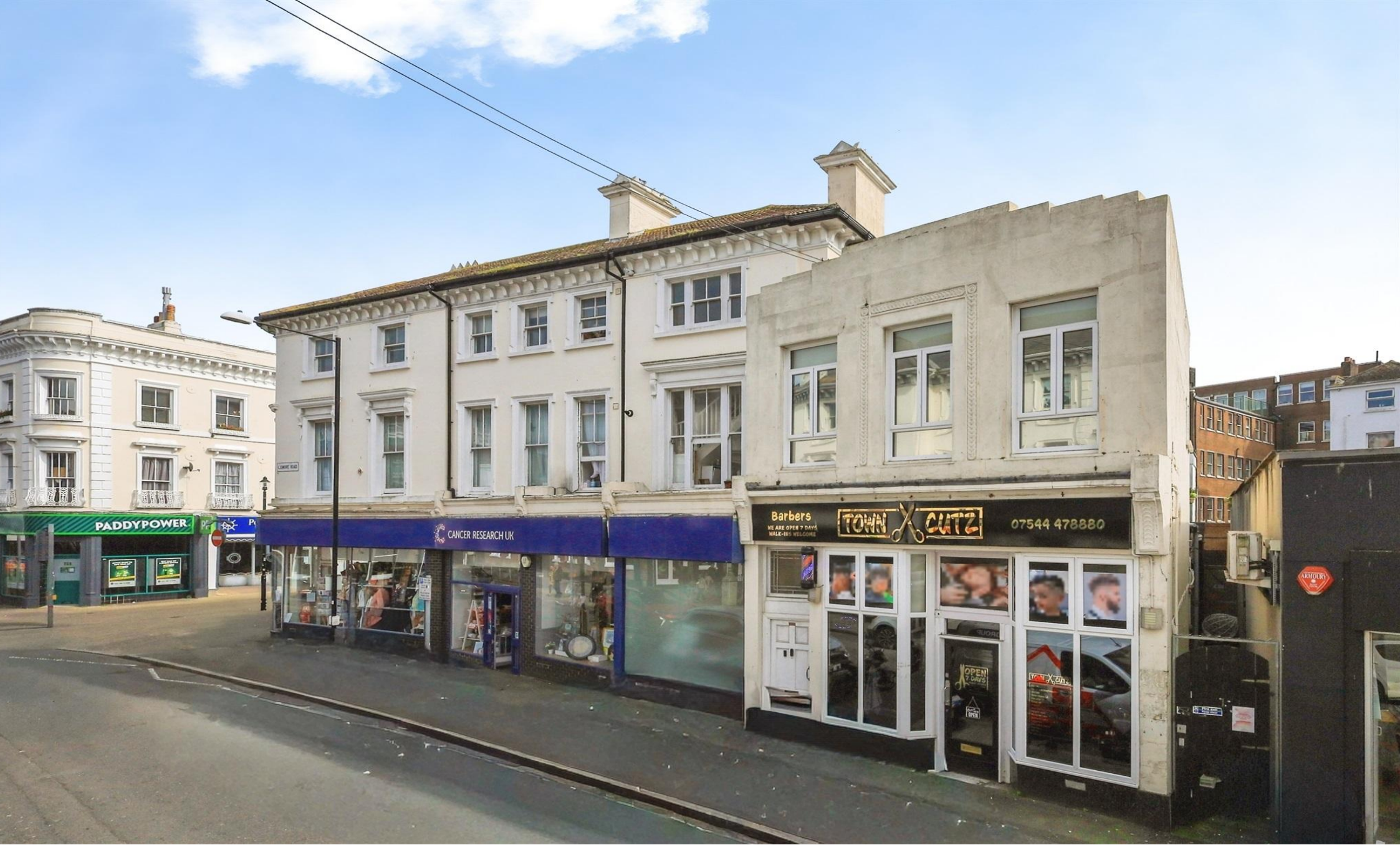
Terminus Road, Eastbourne BN21 3BB