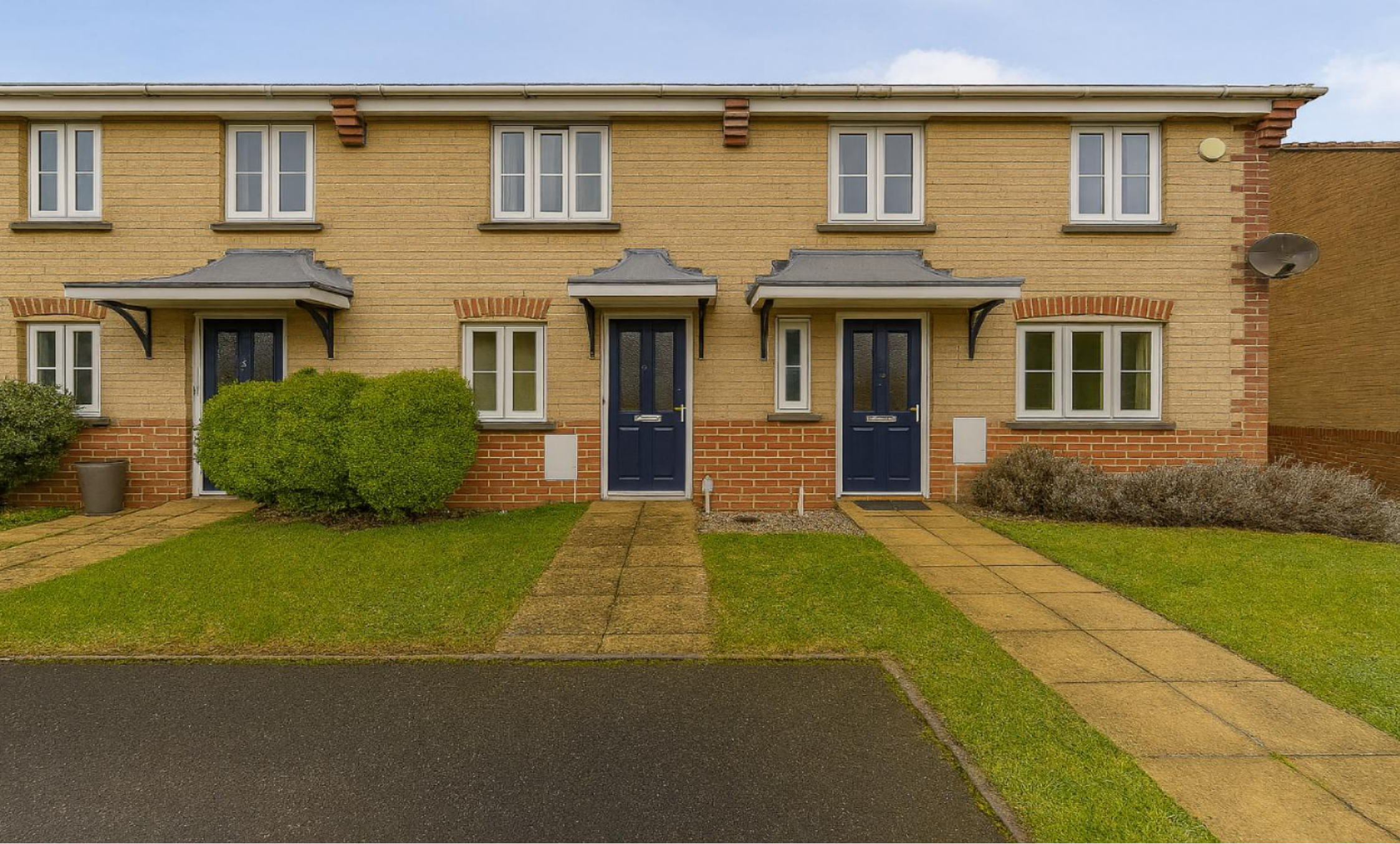
Flazen Close, Bournemouth BH11 8TH