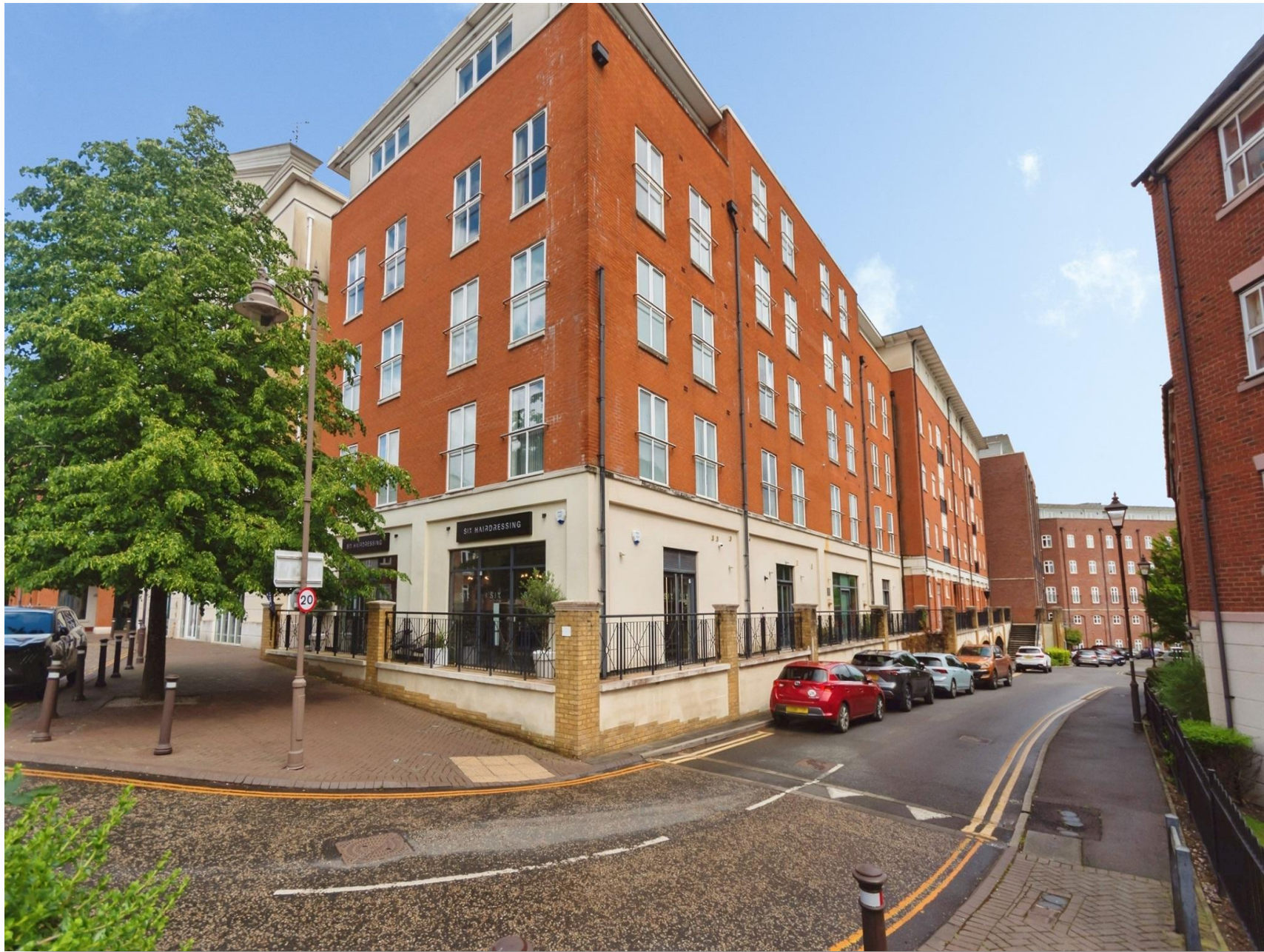
Lock House Waterside, Shirley Solihull B90 1UD