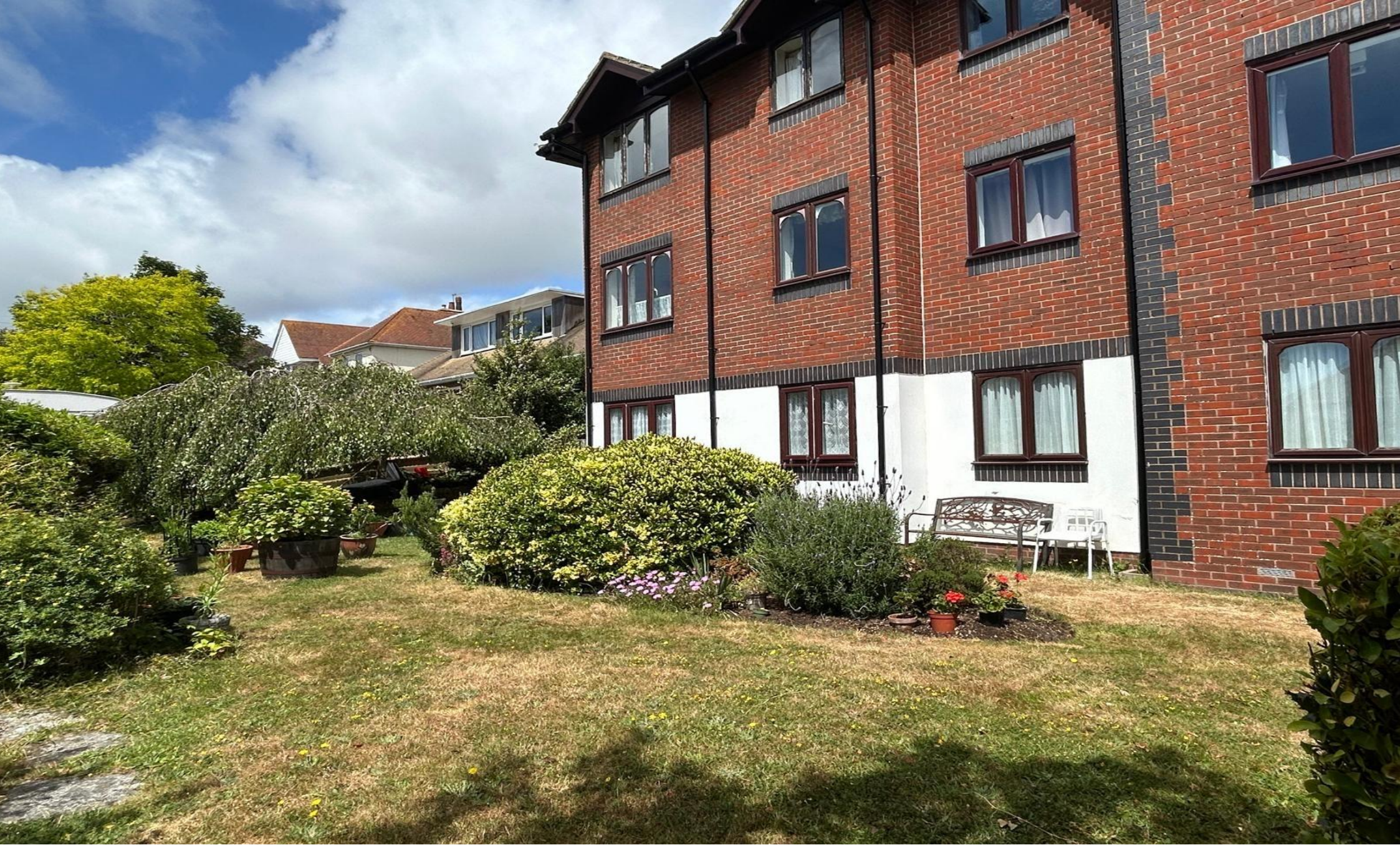
Brockhurst Gate - De La Warr Road, Bexhill-On-Sea TN40 2JJ