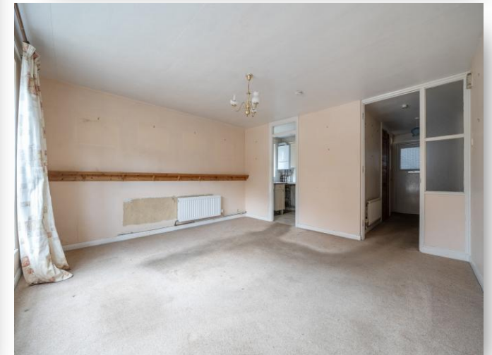
8 Fernley Court, Maidenhead SL6 7NZ