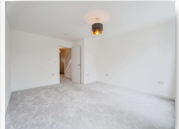
Farrow Road, Bacton, Stowmarket, IP14 4GU