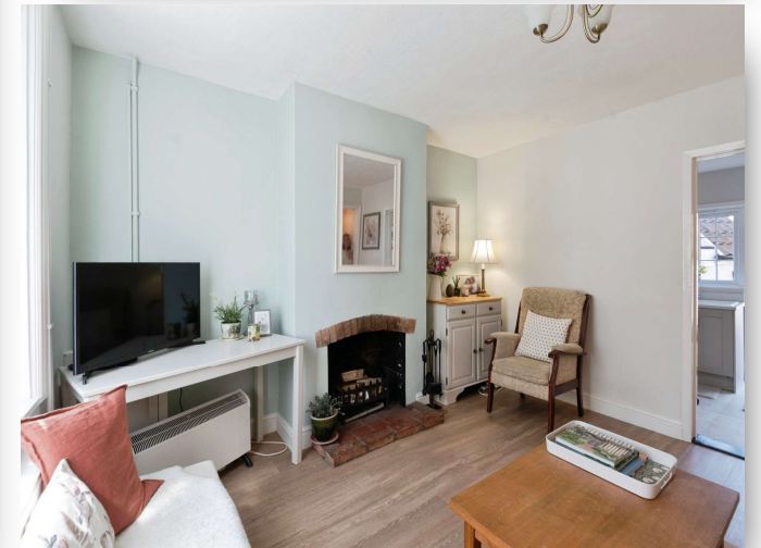
Station Yard, Needham Market, Ipswich, IP6 8AS