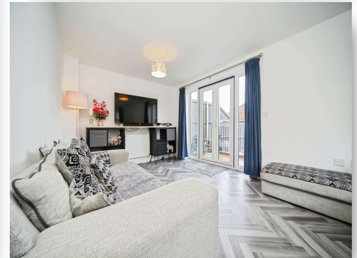
Amis Close, Stowmarket, IP14 1XE