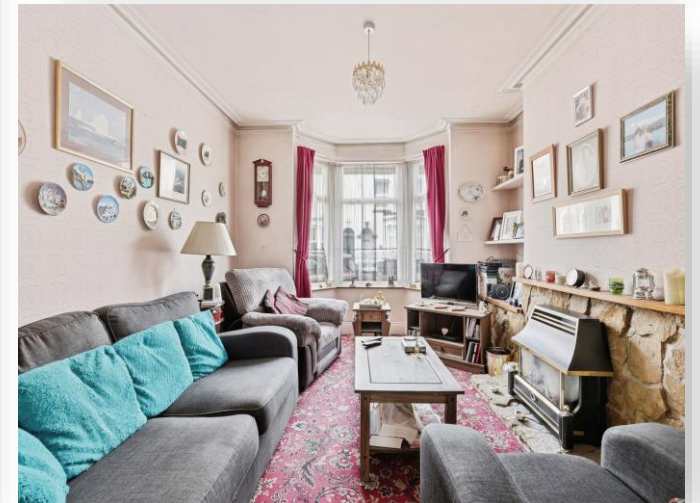
Whitworth Road, Northampton NN1 4HG