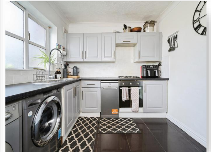
Claudeen Close, Southampton SO18 2HQ