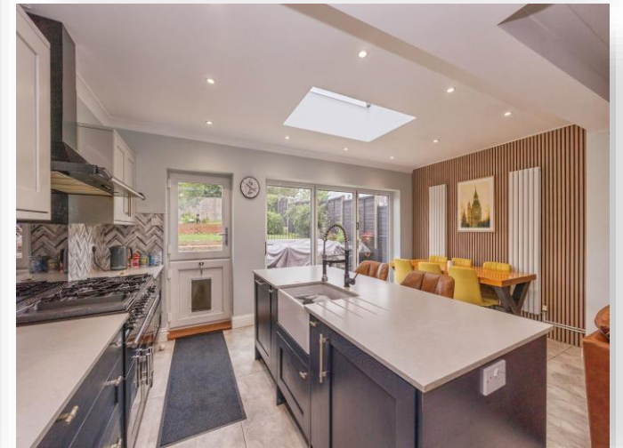
Lone Valley, Waterlooville PO7 5EB