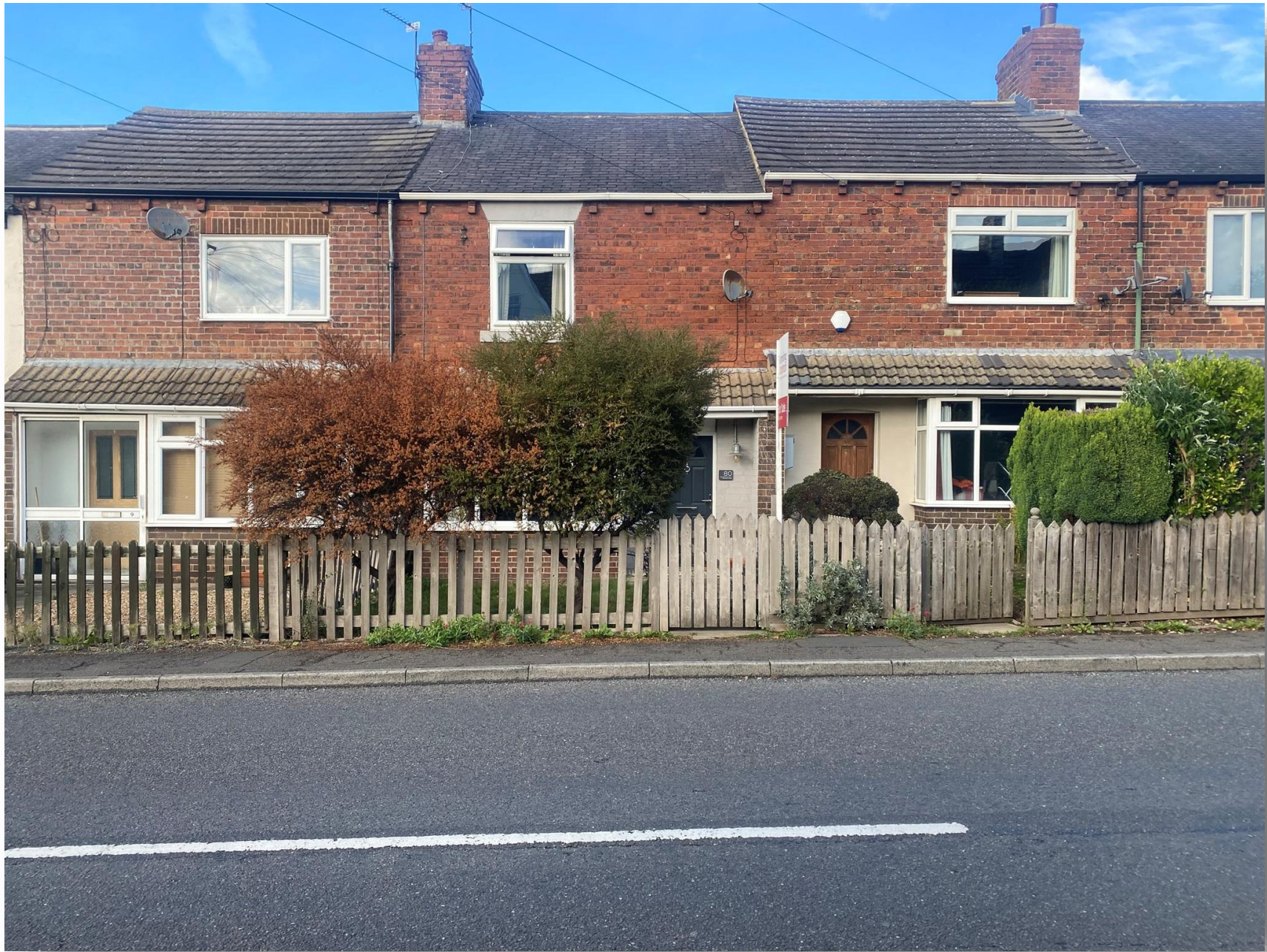
Sturton Lane, Garforth Leeds LS25 2EZ