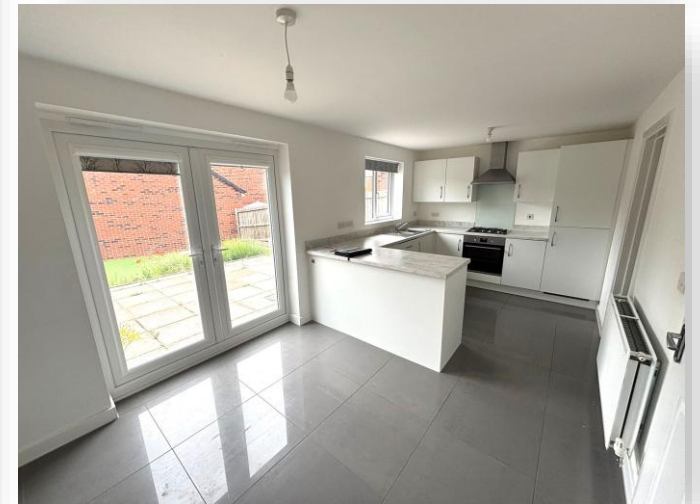
Chaffinch Drive, Shepshed