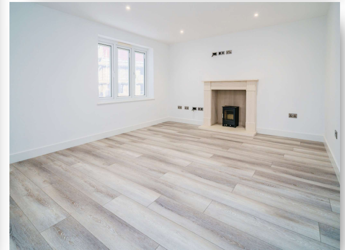
Walnut Tree Close, Nazeing Waltham Abbey EN9 2RJ