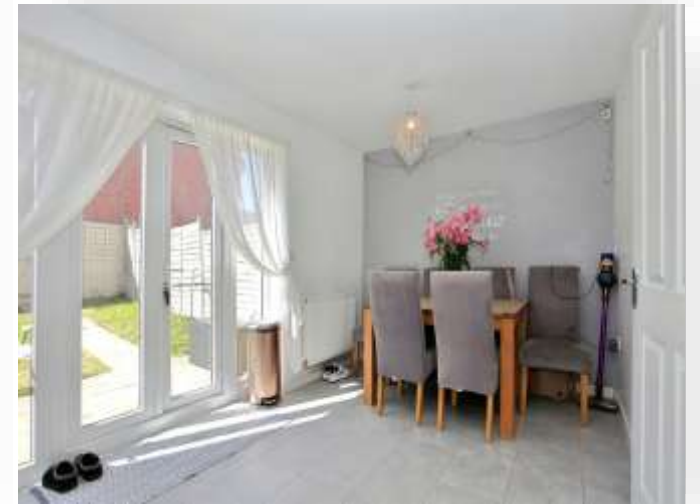
Everest Way, Peterborough PE7 0LS