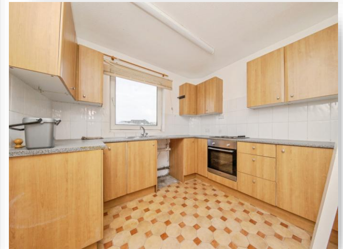
Hale Close, Ipswich, IP2 9QP