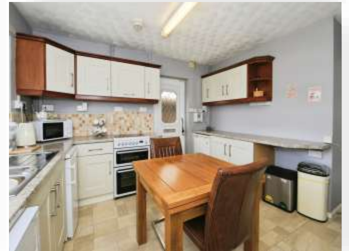
Churchfield Way, Whittlesey Peterborough PE7 1JY