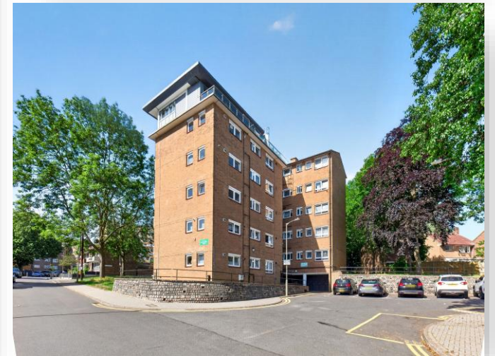
Castlecombe Drive, London SW19 6RN