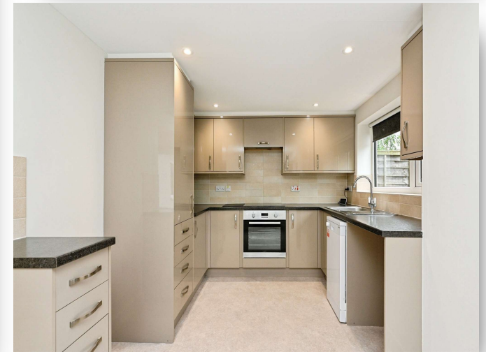
Manor Road, Dersingham, PE31 6LD