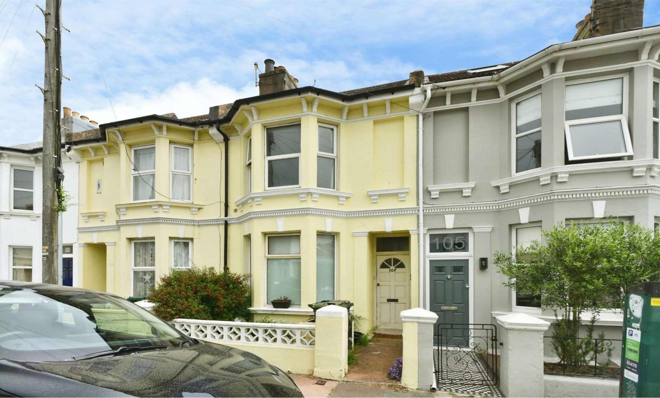
Westbourne Street, Hove BN3 5FA