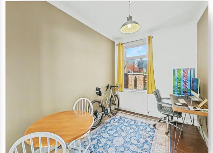
Glasgow Street, Northampton NN5 5BL