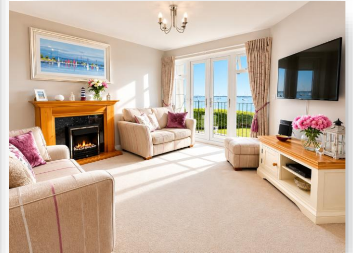
Sussex Court Vanguard Road, Gosport PO12 4FF