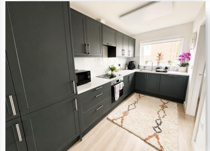
Searle Drive, Gosport PO12 4FT