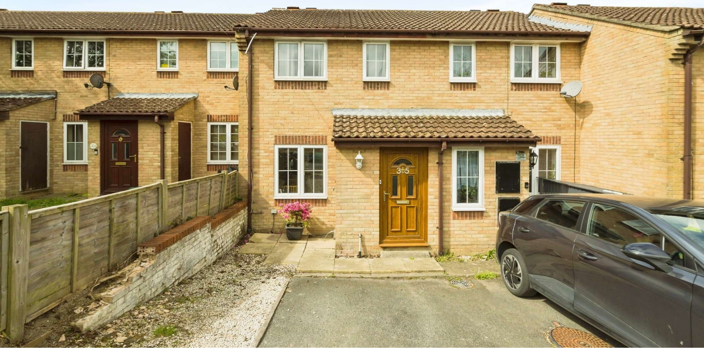
Colwell Gardens, Haywards Heath RH16 4HG