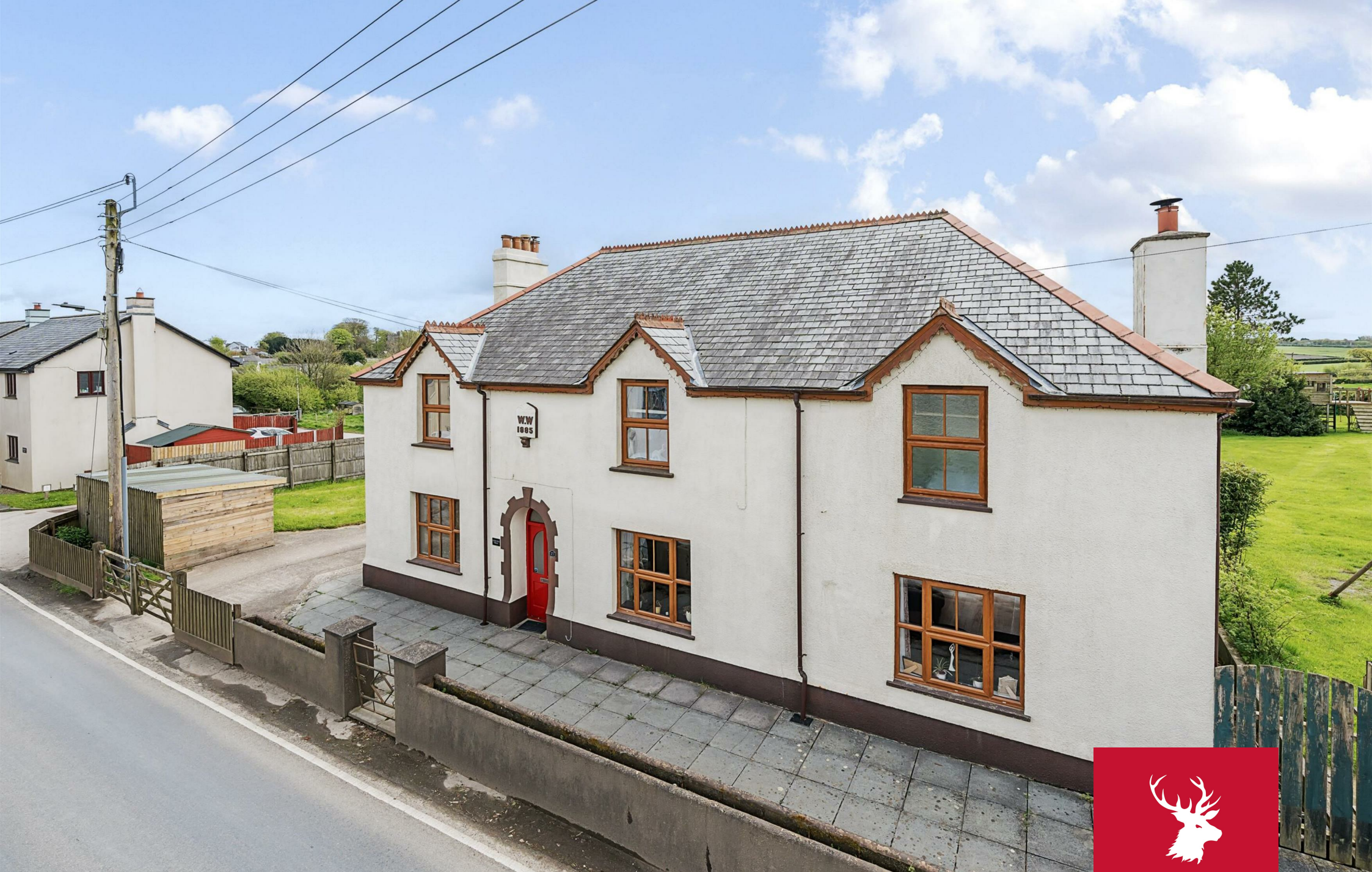
West End Villa