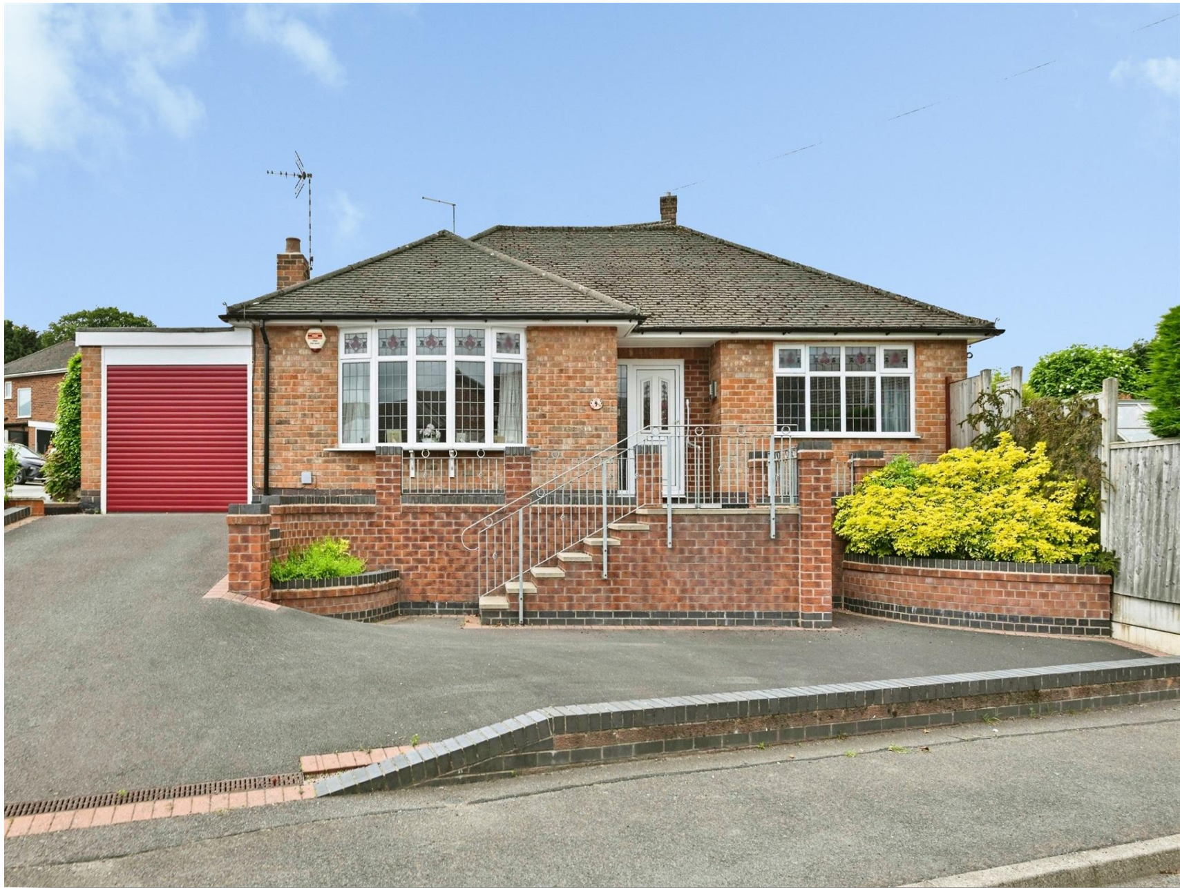
Rivergreen Crescent, Bramcote Nottingham NG9 3EQ