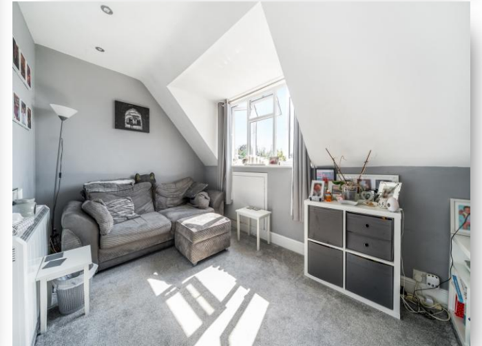
Flat 3, 15 Furze Platt Road, Maidenhead SL6 7ND