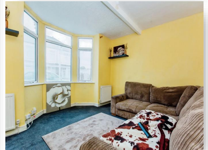
Oakroyd Crescent, Wisbech PE13 3AR