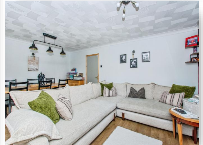
Clarence Road, Wisbech PE13 2ED