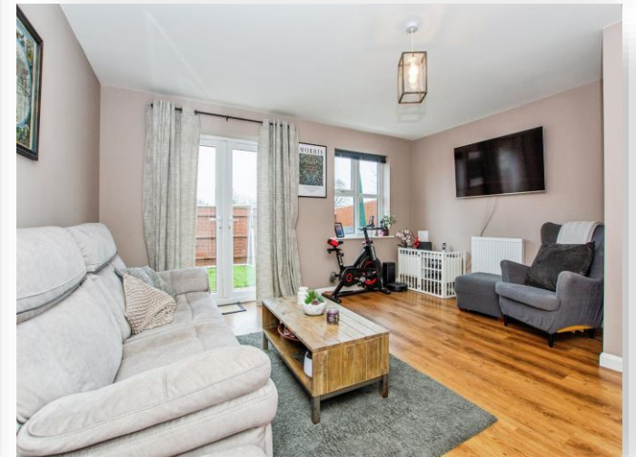
Fenmen Place, Wisbech PE13 3FA