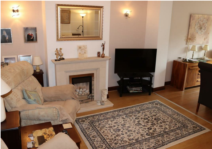
Extended Lounge/Dining Room