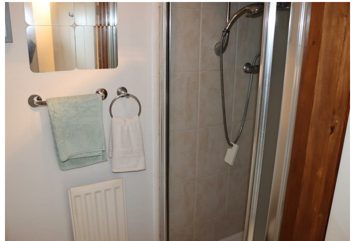
Ground Floor Shower Room