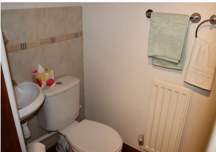
Ground Floor Shower Room