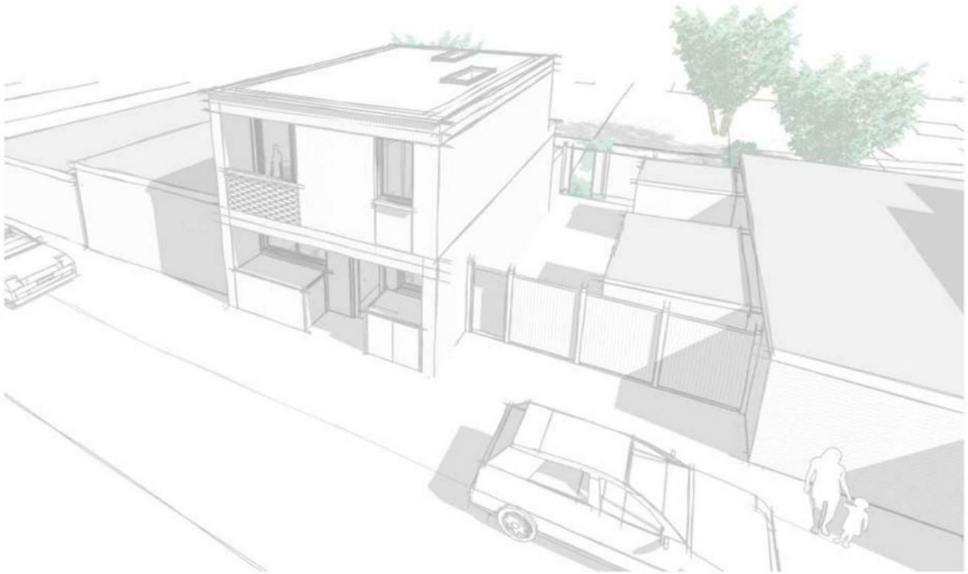
5.4. Front - Aerial 3D view