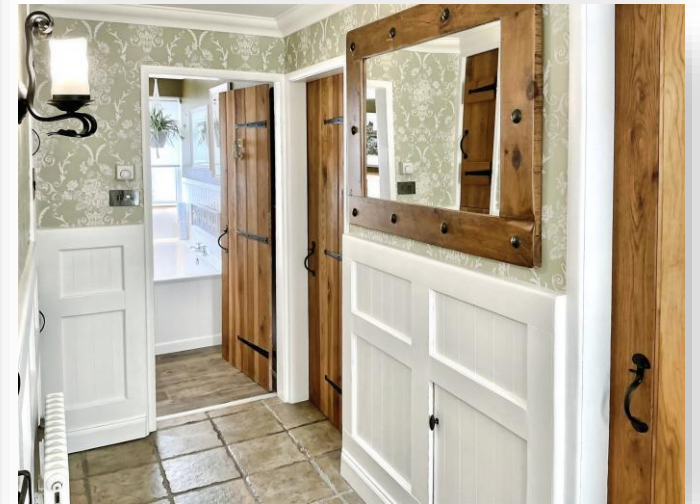
Shannon Crescent, Stockton-On-Tees TS19 7JG