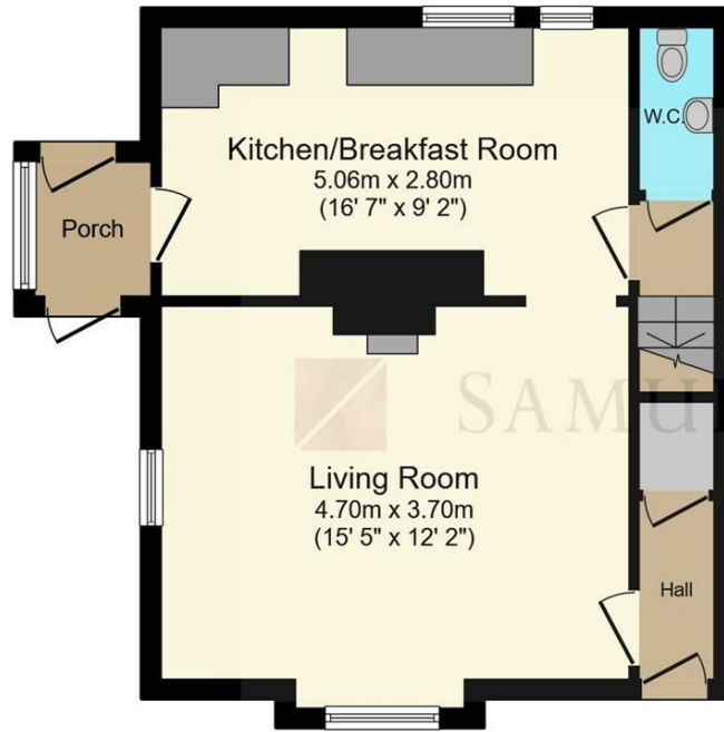
Ground Floor Floor area 41.5 sq.m. (447 sq.ft.)