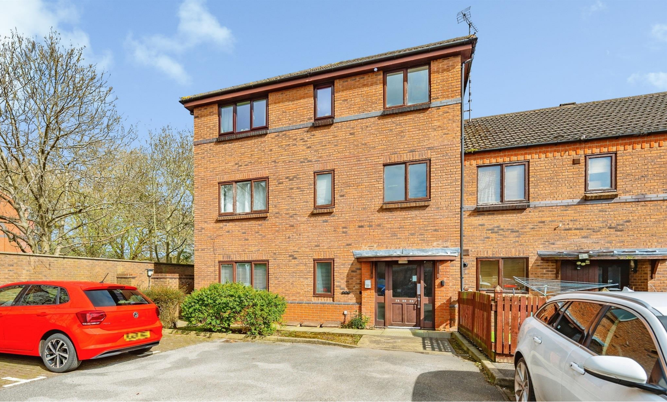
Etruria Gardens, Derby DE1 3RL