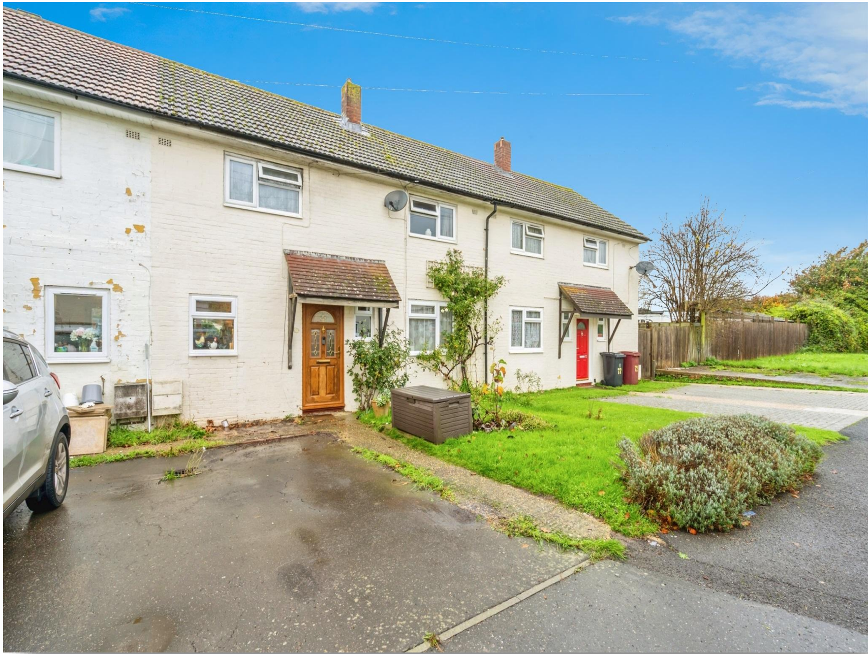
Cheshire Crescent, Tangmere CHICHESTER PO20 2HT