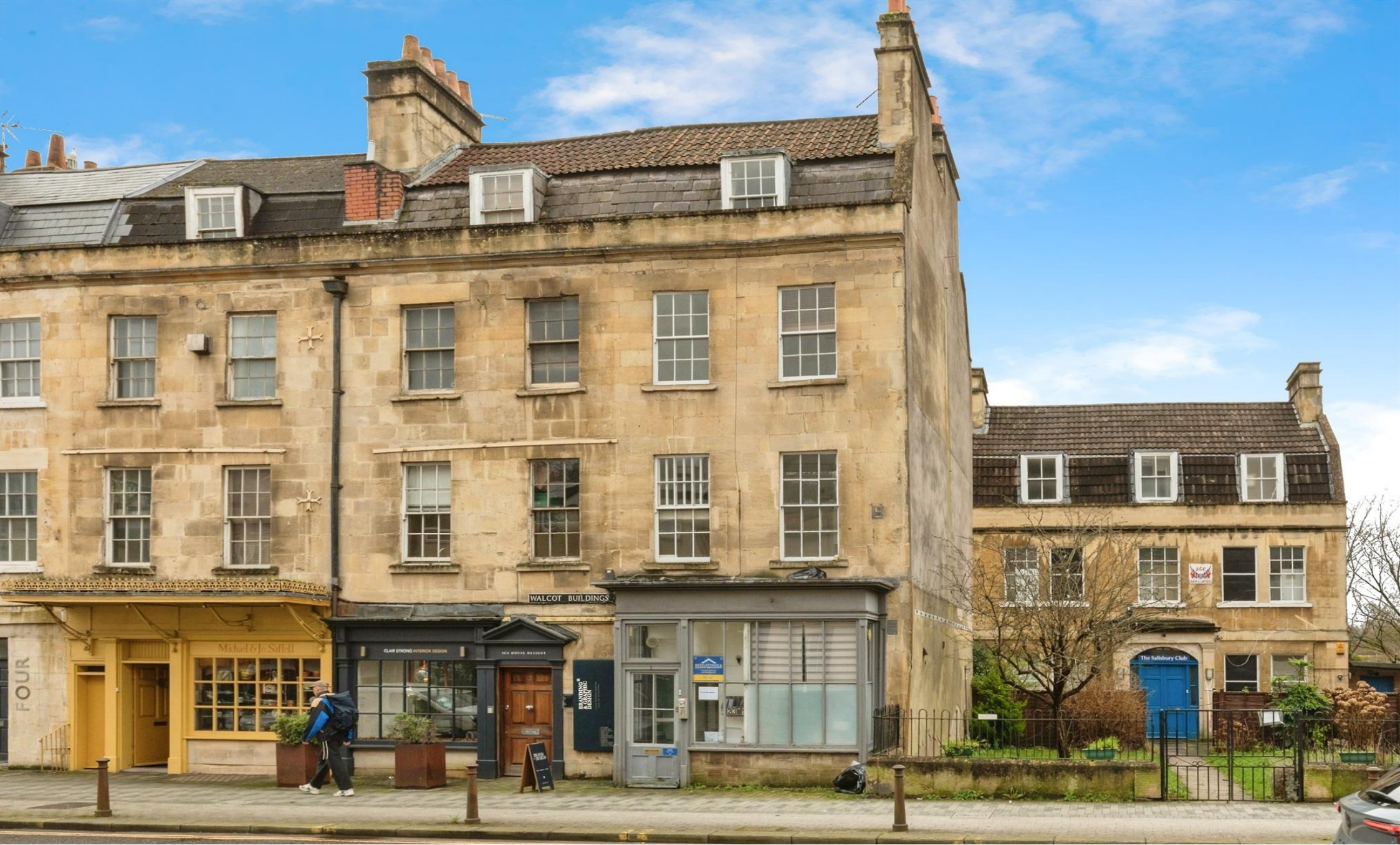
Walcot Buildings, Bath, BA1 6AD