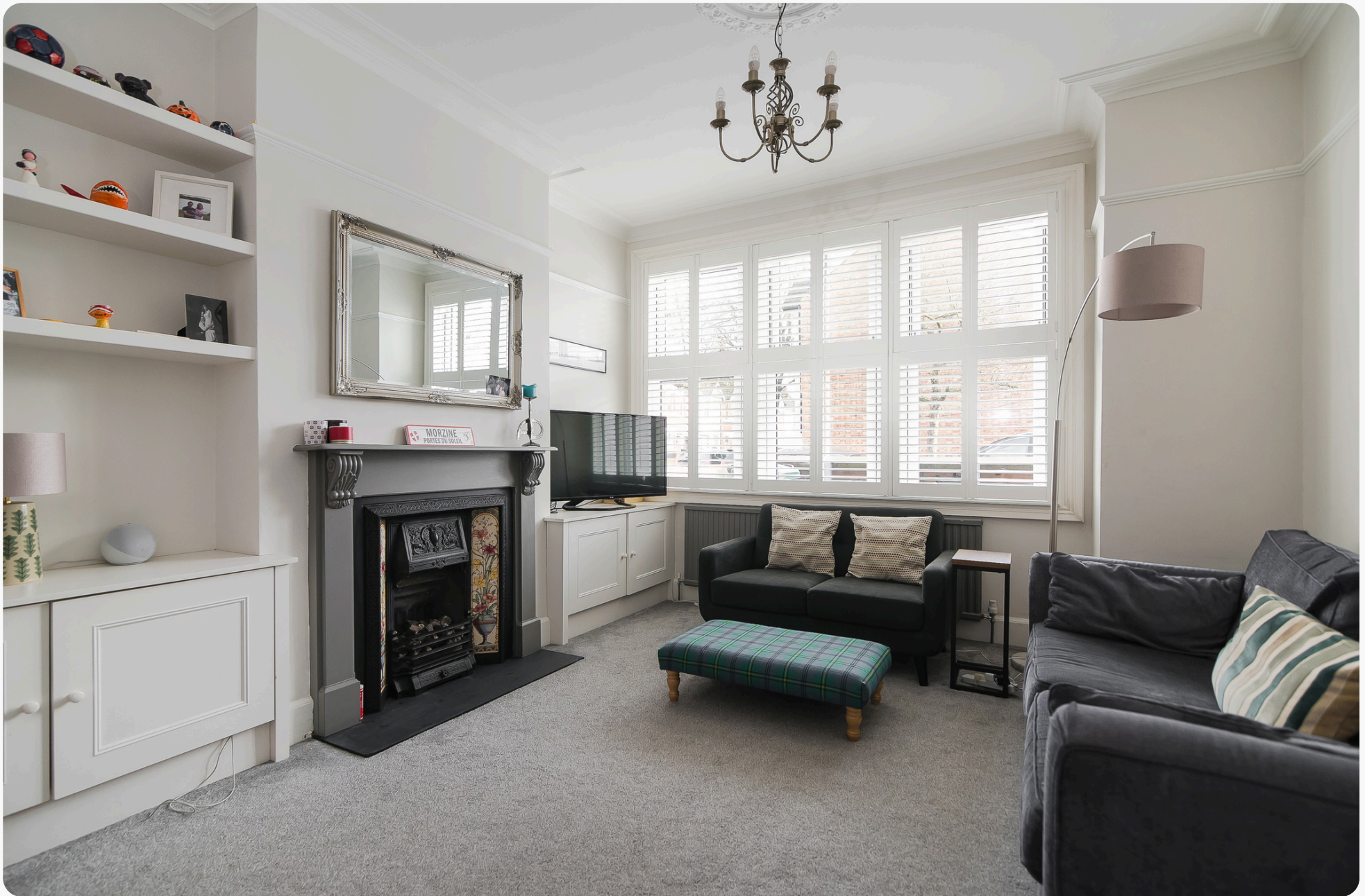
At the front of the property is the beautiful double reception room where you find a superb serene space with a gas fireplace and very useful fitted storage units and shelving. The front bay window is adorned with bespoke plantation shutters which allows for privacy and light from the large windows to flood through the room.