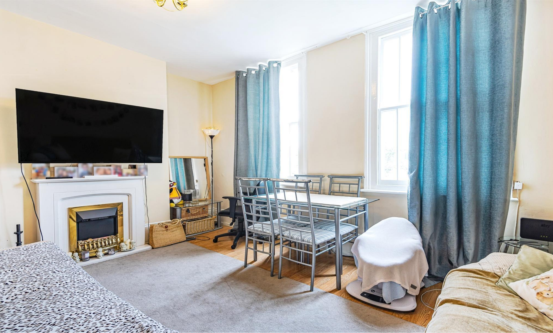
Lorrimore Road, London SE17