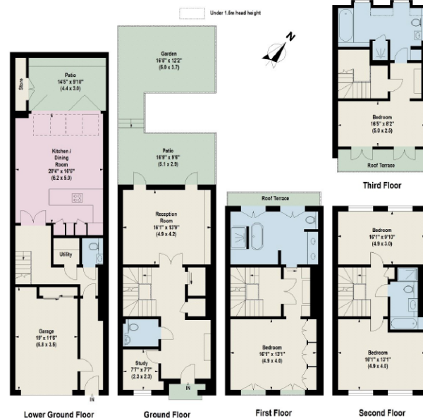
Measurements taken from development brochure

Floor Plan produced for John D Wood by Mayer Floorplans ©. Tel 020 3387 4094 Illustration for identification purposes only, not to scale. All measurements are maximum, and include wardrobes and window bars where applicable. Where a room has a sloping ceiling the dotted line marks 1.500m height, and all measurements shown are at floor level