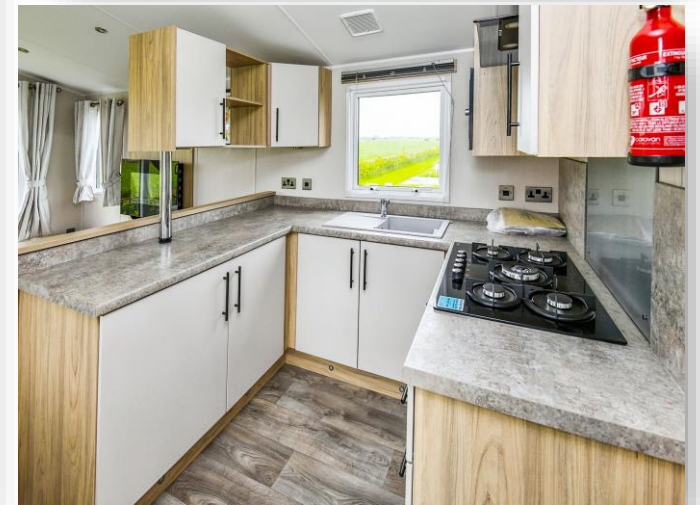
Willerby Sea Lane, Huttoft Alford LN13 9RR