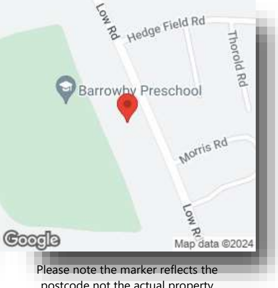
postcode not the actual property