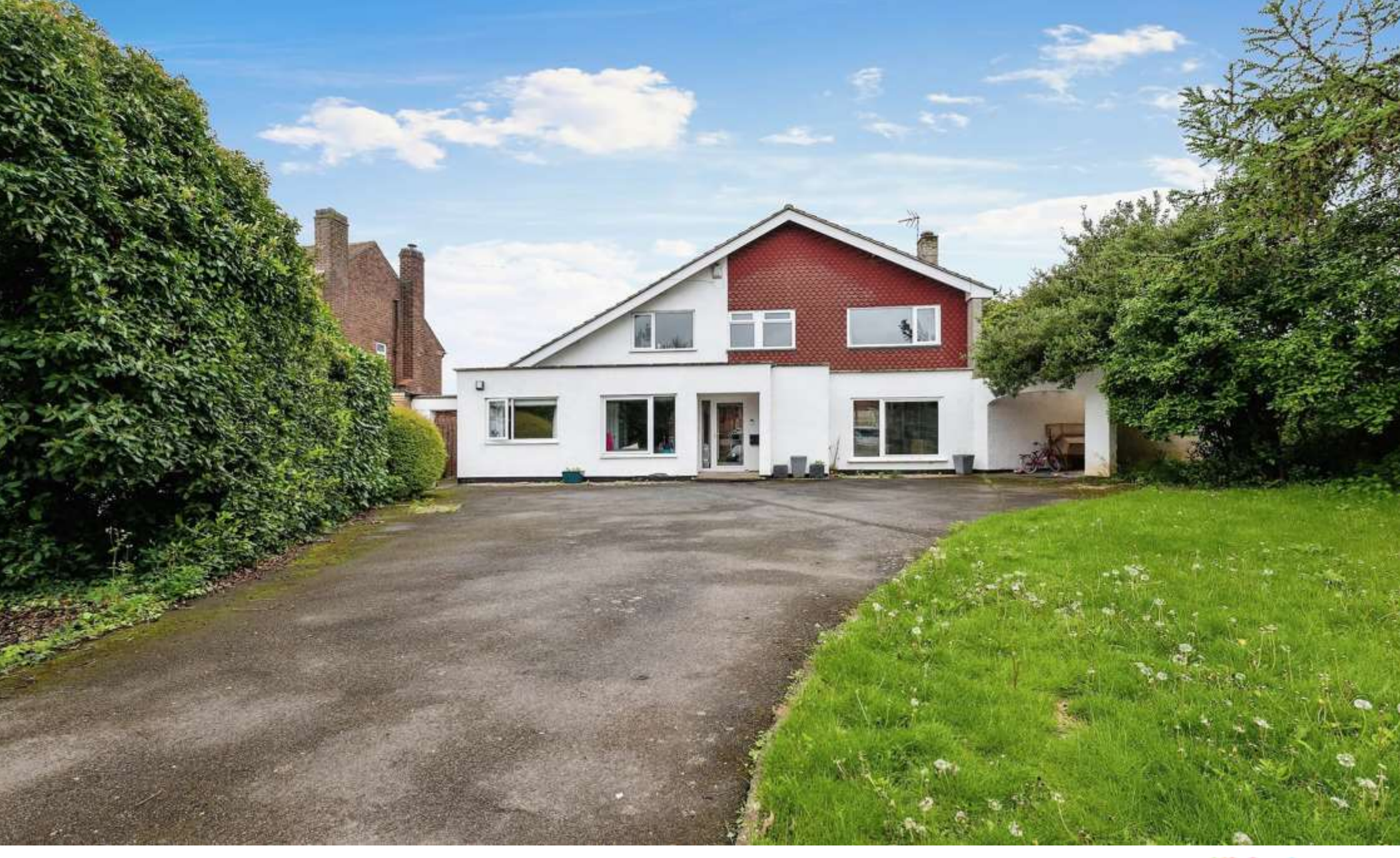
Mount Pleasant, Low Road, Barrowby, Grantham NG32 1DJ