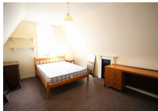
BEDROOM TWO 14'3" x 13'1" (4.35 x 4.01)