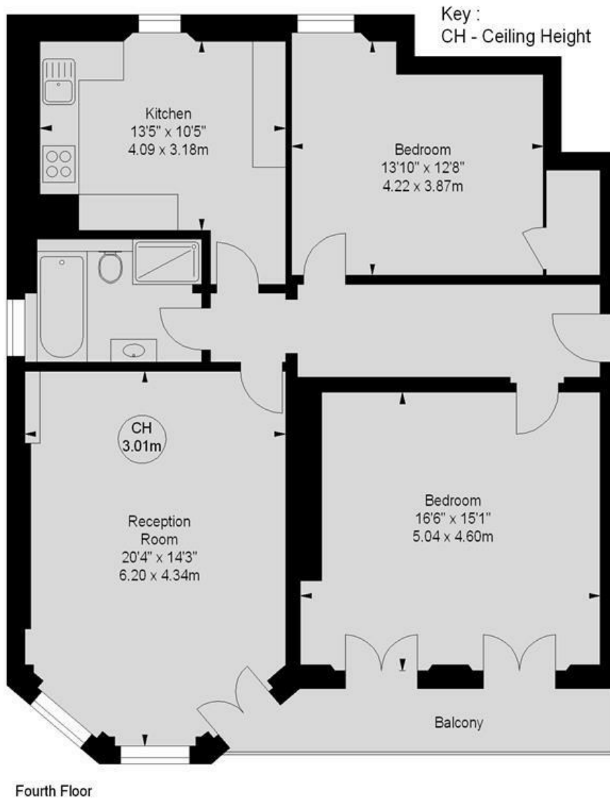
Illustration For Identification Purposes Only. Not To Scale *Floorplan Drawn According To RICS Guidelines

Whilst these particulars are believed to be correct, no guarantee can be given for the measurements, appliances or services. It is our recommendation that all are tested. These are not intended to form part of any contract. Tate's accept no responsibility for their accuracy.