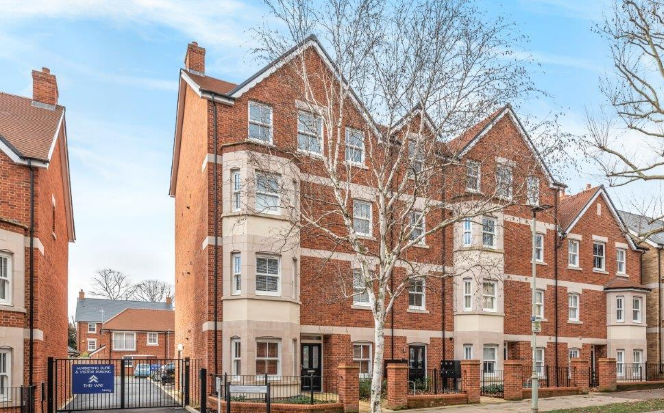
FLAT 38, DE MONTFORT PLACE, WARWICK AVENUE, BEDFORD, MK40 2FN