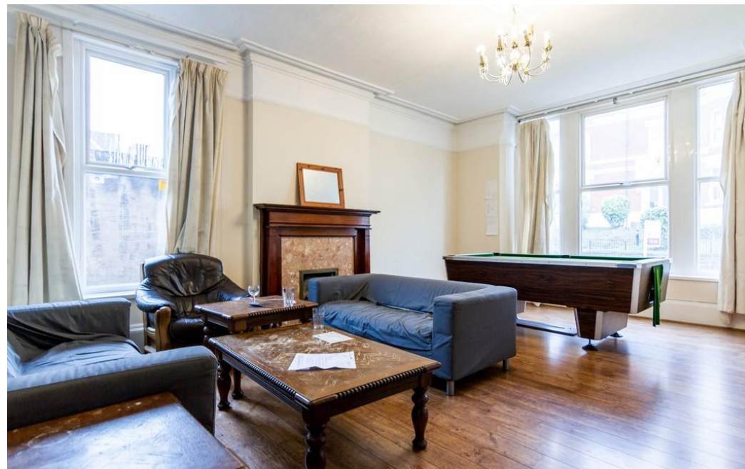
Front Living Room