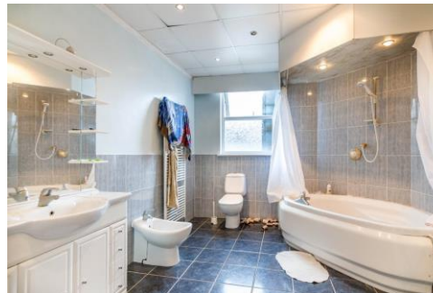
Huge En Suite