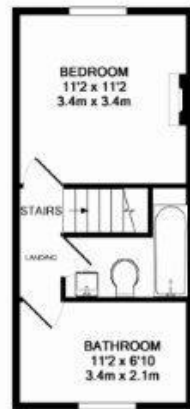
1ST FLOOR APPROX. FLOOR AREA 282 SQ. FT. (26.2 SQ. M.)