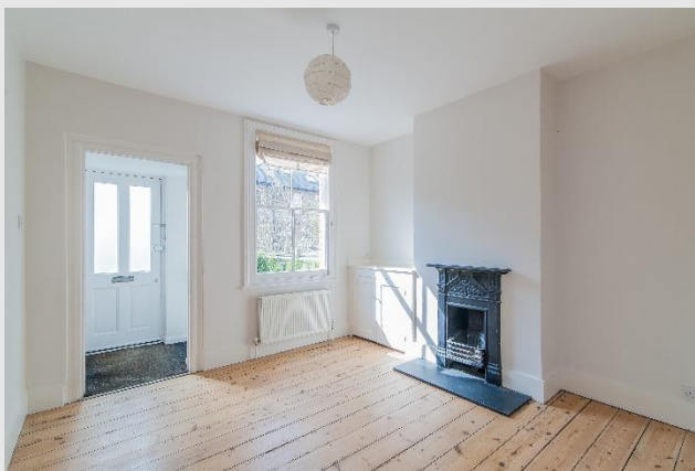
Left ___RECEPTION Below ___RECEPTION

Having been recently renovated this adorable cottage is ready for its new owners to simply unpack and move in.