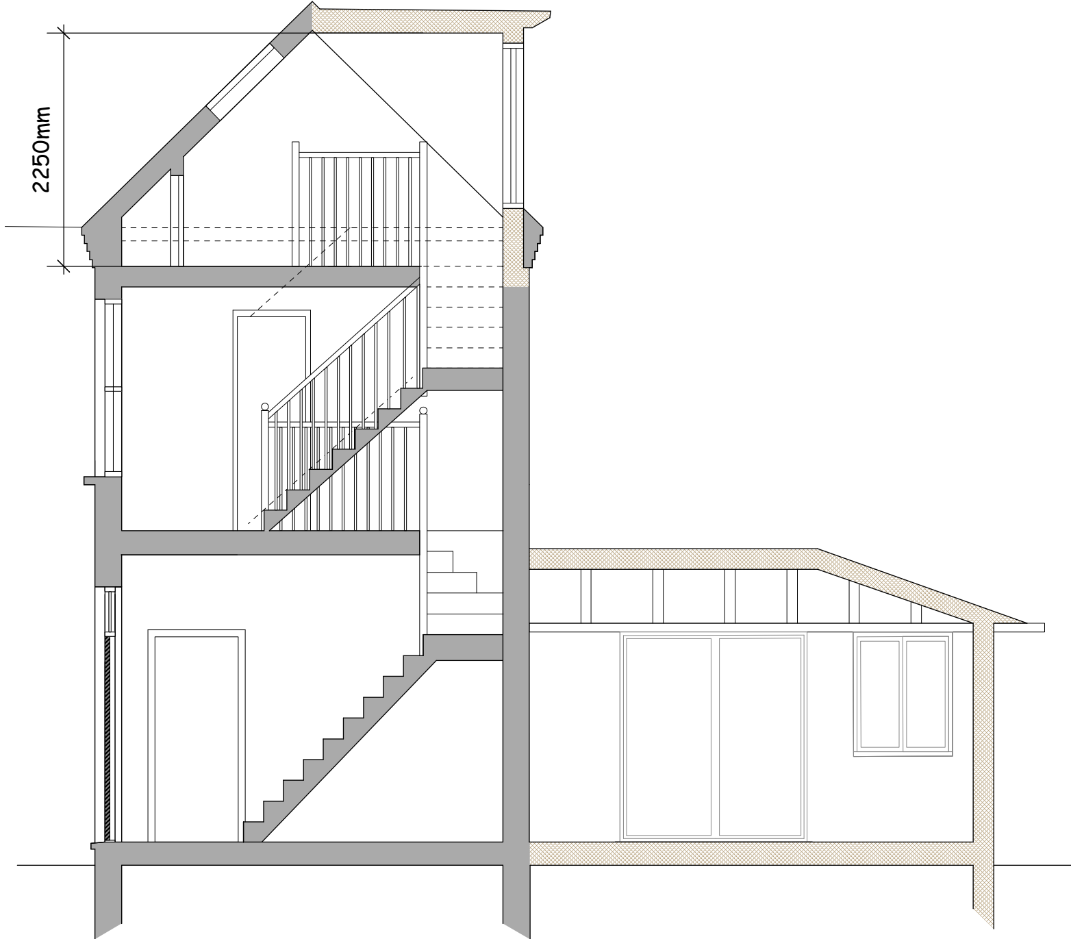
Section A- A as Proposed